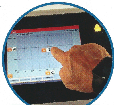
Touch Screen Interface